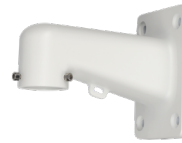
PFB305W Wall Mount