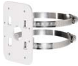
PFA152 Pole mount