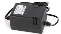
AC24V/1.5A Power Supply