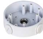
PFA139 Junction Box