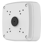
PFA121 Junction Box