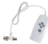
PFM820 UTC Controller