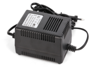
AC24V/3A Power Adapter