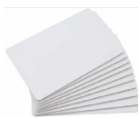
IC-S50 MIFARE® Cards