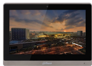
DHI-VTH1660CH 10.2-in. Color Indoor Monitor