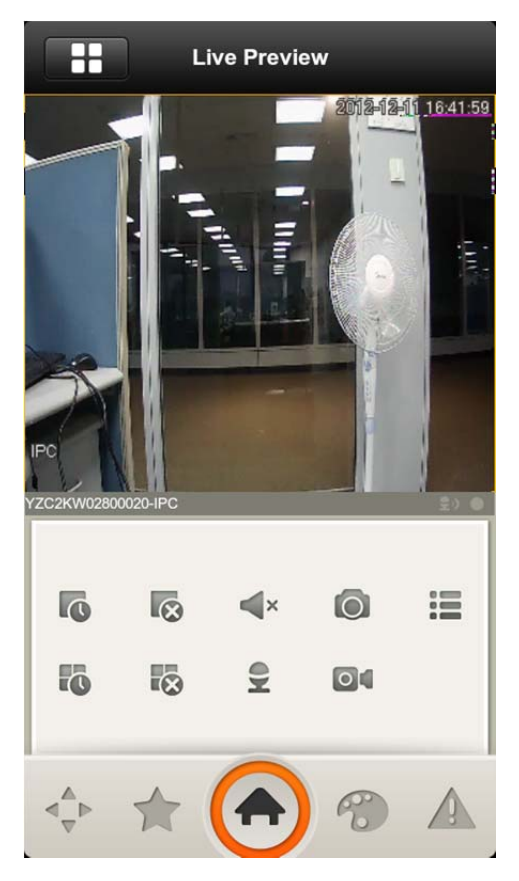
Figure 10 Mobile Phone Monitoring