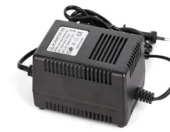
AC24V/3A Power Adapter