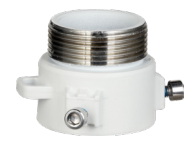
PFA118 Mount Adapter