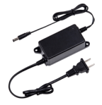
DH-PFM320D-US Power Adapter