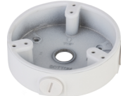
PFA137 Junction Box