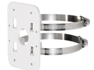
PFA152-E Pole Mount