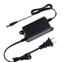
DH-PFM321D-US Power Adapter